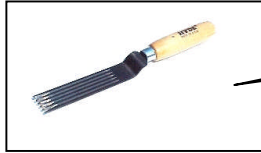
5 Groove Trim Knife # BB 65060 $38.55